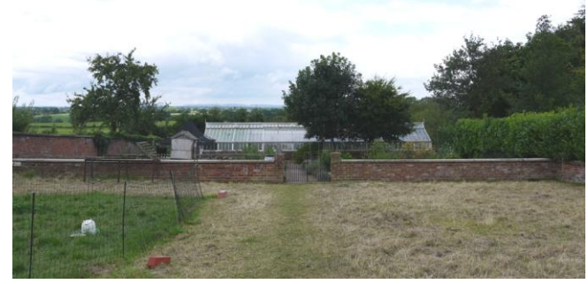
Westerly views to the sandstone ridge from the upper kitchen garden