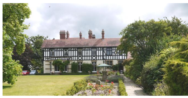
Hankelow Court seen from the garden

<u>Hankelow Court</u> is a splendid late Victorian villa constructed around an earlier house, which in turn was altered and extended in the Edwardian era. The house, stables, yard and walled kitchen gardens remain in single ownership. Much of the current layout dates from the late 19<sup>th</sup> century when the garden was extended beyond the ha ha to create a sunken garden, now a tennis court, and the kitchen garden was developed as a series of gardens separated by low walls stepping down the slope.