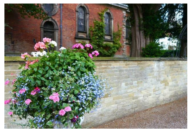
A Capesthorne container

It is well worth a further visit. Capesthorne is open on Sundays and Mondays from March to October.