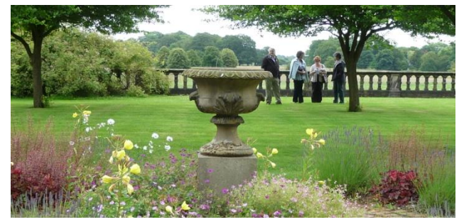
Beyond the stone urn, part of the balustrading

The yew topiary is clipped and the large grass areas are mown by the Arley garden staff, but Charles mows the circle and the fiddly bits of lawn around the edges of the garden while Jane looks after the flower-beds.