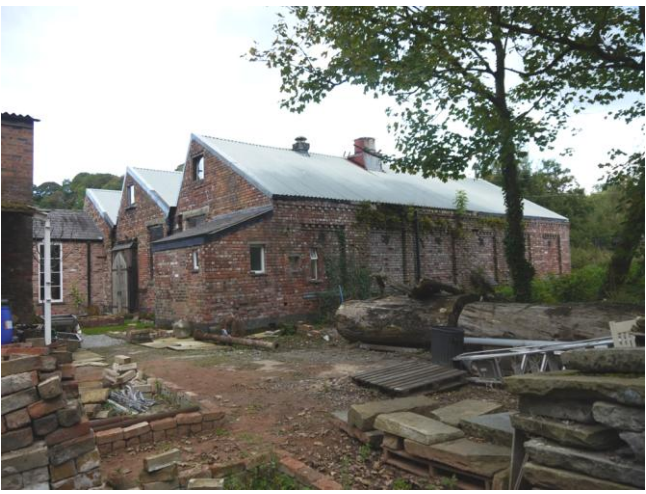
The former dying shed at Doe Meadow House containing the silk trail

The present owner of the silk works has created a home in one of the buildings, a holiday cottage in another and is in the process of creating a series silk route gardens in the main dying shed. Artefacts gathered from a range of sources embellish the trail to be followed by visitors and educational groups following the silk route from China to Europe.