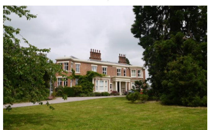
Brook House from a similar vantage point in 2014, extended on the left hand side, with the mature Wellingtonia, right of picture