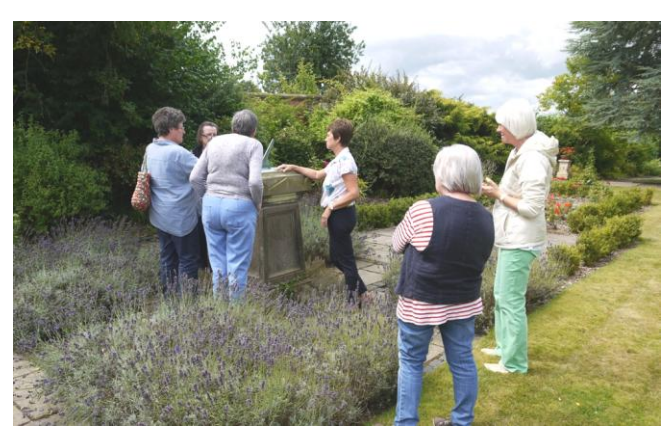
Members trying to identify the inscription on the sundial

<u>Doe Meadow House</u> lies within the former grounds of 17<sup>th</sup> century Langley Hall. The property underwent change in 1780 when the River Bollin was diverted and