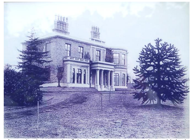
An early photograph of the house showing recently established conifers.

The house had kitchen gardens, enclosed by a north wall and with a southern boundary formed by a hedge that has been removed so that the garden wraps round the house on two sides. One former kitchen garden contains the layout of a later rose garden, now put down to grass, and there are some ancient apple and pear trees which still yield flavoursome crops. The property is attractive, but as more and more such properties are lost to development, their rarity and therefore significance must surely increase.