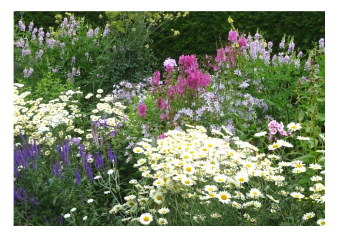
Above and below, the borders burst with perennial plants