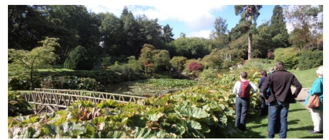
The Temple Garden at Cholmondeley was hugely admired