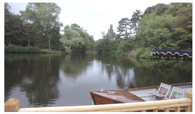
Boating on the lake is still available

Altering the existing house several times Lever designed the grounds with Mawson one morning before breakfast. It incorporated his characteristic straight walks (for thinking), raised terraces and a lake for boating and swims.