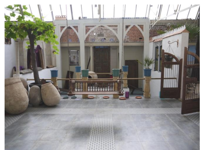
The 'Persian garden'

The silk trail gardens are a work in progress and add to the number of 'story' gardens in Cheshire - Poulton Hall and Mellor's garden to name but two - and perhaps extending concepts of what a garden is.